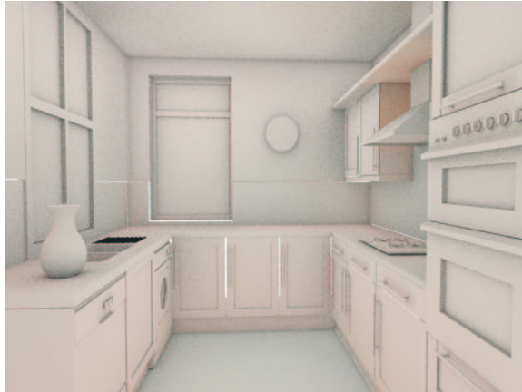
(a.) Square root function