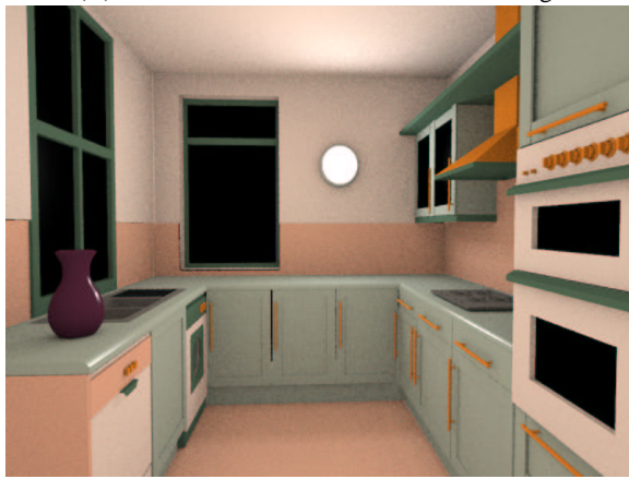
(c.) Without mirroring surfaces. 355 secs. rendering.