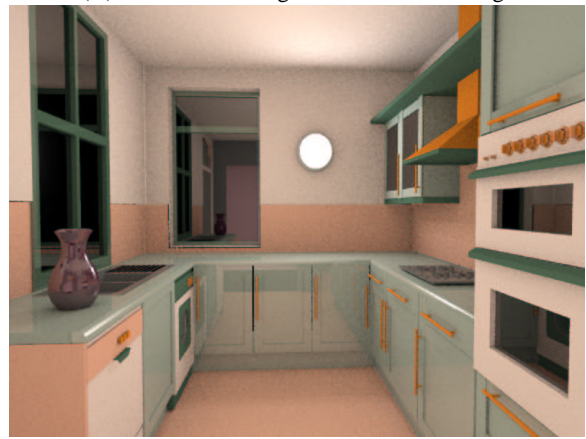
(d.) Final image with every feature included. 527 secs. rendering.