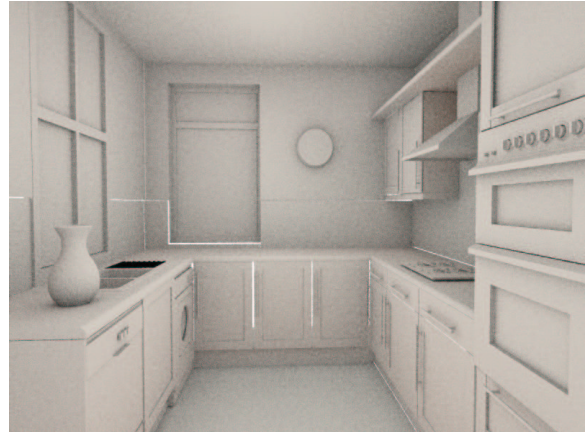
(b.) Negative exponential function