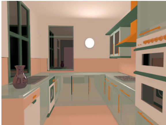
(a.) Without obscurances. 260 secs. rendering.