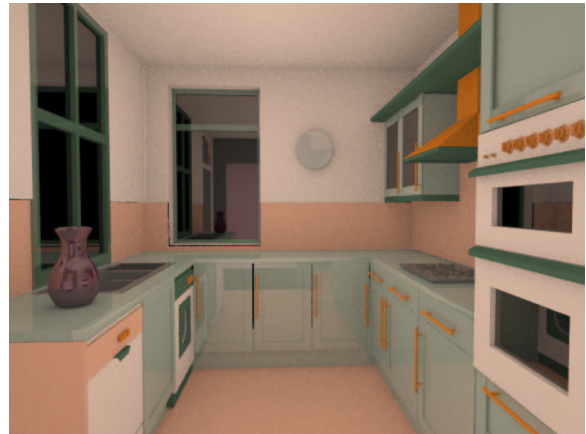
(b.) Without direct light. 396 secs. rendering.