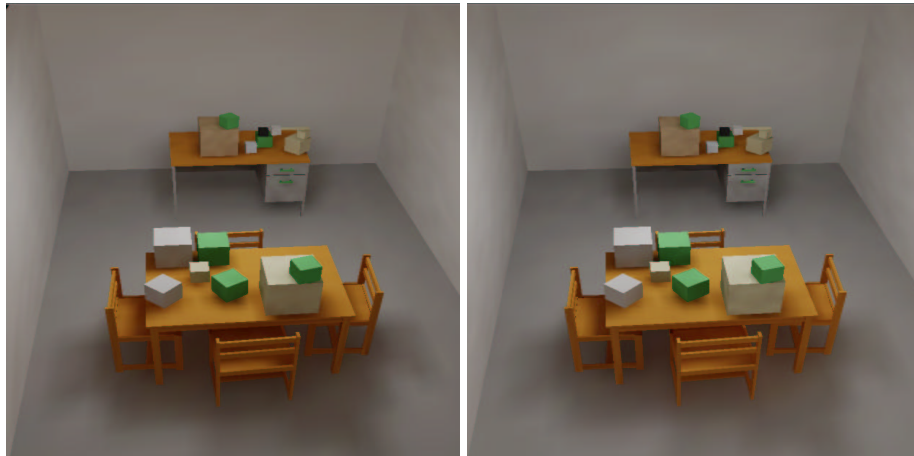
Fig. 3. (left) Frame 17 without reusing paths. 600.000 paths. Time= 70 sec. (right) Frame 17 reusing shooting and gathering paths. 600.000 paths. Time= 11.7 sec. MSE is a bit higher in the second image. Speed-up factor about 4.4.